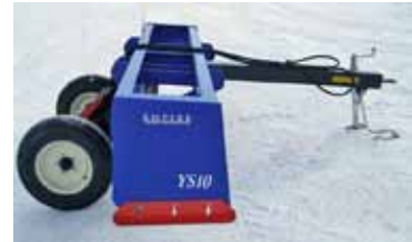
Empire Welding & Machining Ltd. Box 1565

10 Foot Ultra Yard Scraper YSM-10; replaceable cutting edge, skid shoes, safety chain, jack, all hydraulics, hose whip, high tensile steel box body, industrial paint. Levels ground for smooth surface, fills in holes, depression and cuts down bumps. Levels and spreads gravel base, snow removal and fills in field washouts. Additional Options NOT INCLUDED but available are: three point hitch, forklift and skid steer attachment. FOB North Battleford, SK.