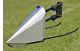
Tridekon RR #2

Tridekon Cropsavers are stainless steel cones designed to reduce tramping and damage of the crop made by the sprayers tires. The Tridekon design combination of bolt-on mounting, quick attach and cone styles allows for their mounting on virtually any high clearance sprayer and pull type sprayers or tractors.