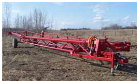
Double A Trailers

Let Your Equipment Pay For Itself! Ask us how the Water Cannon can save you time, fuel and wear & tear on your expensive equipment. The cannon will blast water over 4 acres in a 190 degree arc to dry out low spots fast and efficiently. To ensure your unit, order now on 2011 prices for early spring 2012 delivery. Contact us today at 780-657-0008 or email us at abmarten@telus.net. Double A Trailers & Contracting, Leasing Opportunities Available CALL US TODAY.